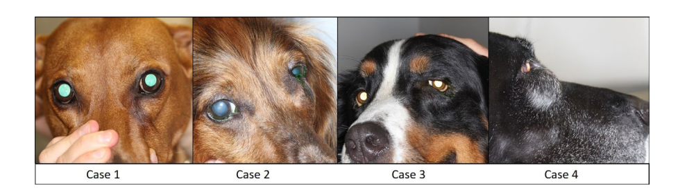
FIGURE 1 Case 1–4: cystic process medio-ventral to the nasal canthus of the eye

The patients of the study were middle aged to old, dogs from different breeds and gender. Time between onset of the appearance of the cystic process and presentation of the animals to our hospital was more than 6 months in all cases.