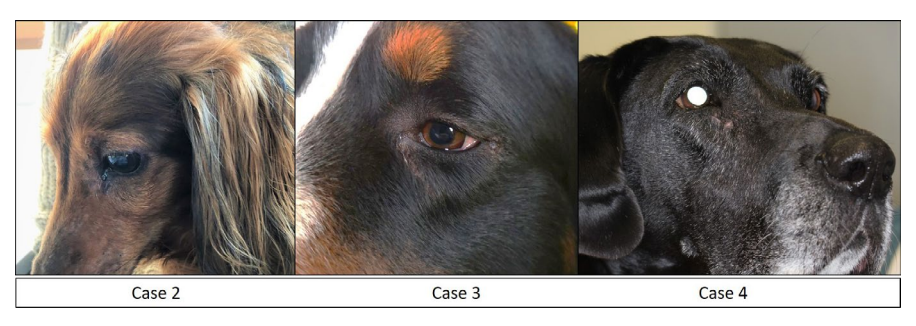
FIGURE 6 Case 2: clinical presentation post polidocanol; Cases 3 and 4: postsurgical

partially cystic proliferation and a cystic structure surrounded by an attenuated epithelium consisting of a double layer of cuboidal epithelial cells,<sup>18,19</sup> characteristic of the excretory duct associated with lobules of lacrimal gland tissue clearly suggest cyst formation from a glandular excretory duct and/ or glandular tissue.