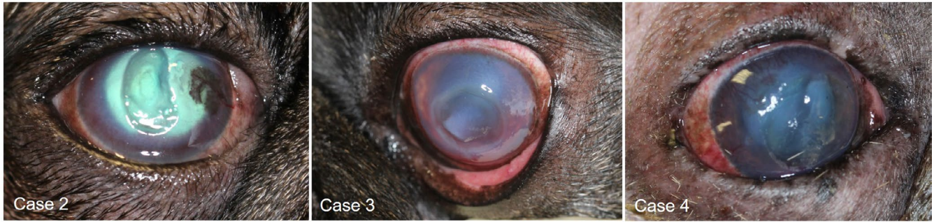
FIGURE 1 Deep corneal ulcers in three dogs with BOS

examination was performed revealing loud breathing, stertor, and stridor in all four dogs.