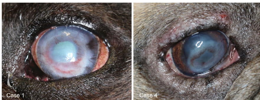
FIGURE 4 Corneal healing immediately after releasing of the third eyelid flap

Most commonly isolated bacteria in infected corneal ulcers are Staphylococcus and Streptococcus spp. 20 In this study, Streptococcus canis could be detected in two cases. In contrast, the corneal swab sample of the melting ulcer in case 4 was negative.