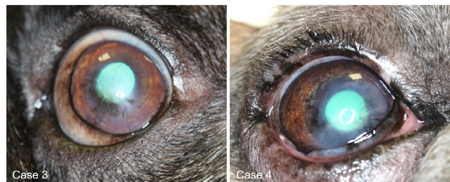
FIGURE 5 Excellent corneal transparency six weeks postoperatively